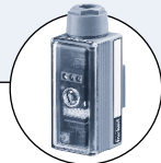
Type 1078 Timer unit