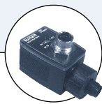
Type 2511 ASI cable plug

Type 0406 is a pilot controlled solenoid valve with servo-piston and is suitable for media up to + 180 °C. A minimum differential pressure of 1 bar is required to fully open the valve.