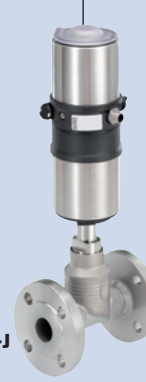
Valve system Continuous ELEMENT Type 8802-GD-L 2301 + 8694

If you click on any of the "More info" orange boxes below you will be taken to the product on our website where you can download the datasheet.