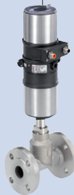
Valve system Continuous ELEMENT Type 8802-GD-I 2301 + 8692

Globe control valve with desired control unit