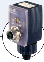
Type 2511 ASI cable plug

Direct-acting plunger solenoid Type 355 for neutral gases and liquids. Also suitable for high temperatures, such as hot water, hot air, steam.