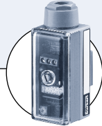
Type 1078 Timer unit