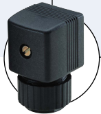
Type 2508 Cable plug