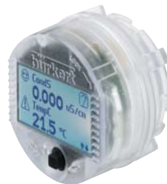
The transmitter can be operated with and without this display module

The graphic display enables comfortable reading and setting of parameters, which shortens start-up time.